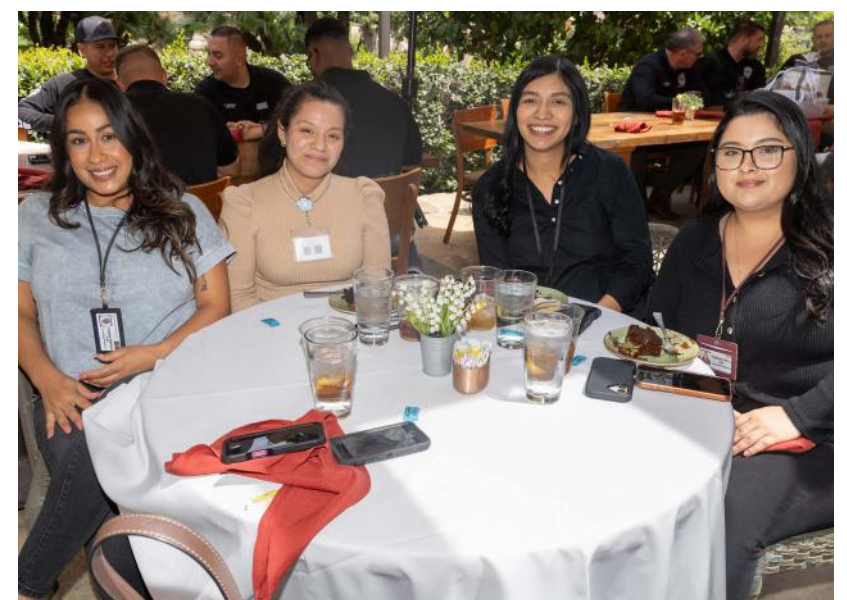
Riverside County children's social workers