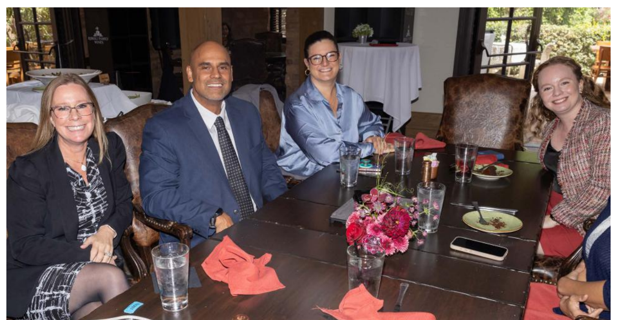
Riverside County District Attorney's office