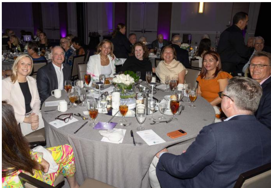
CHL Sponsors SBEMP Attorneys