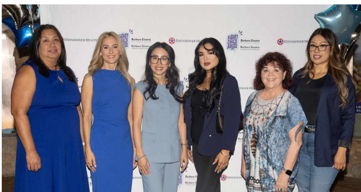
BSCC Forensics Team