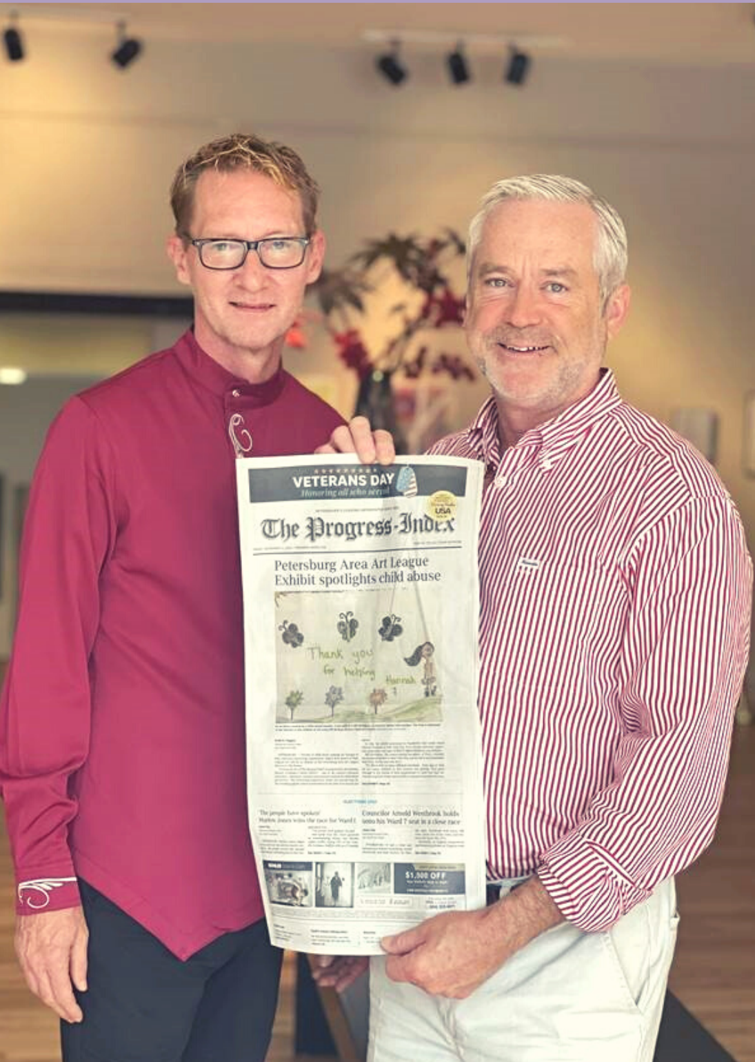
EXHIBIT IN GRAND CENTRAL STATION IN NEW YORK AND PETERSBURG AREA ART LEAGUE MUSEUM IN PETERSBURG, VIRGINIA